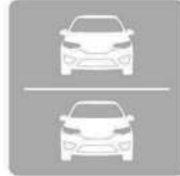
Ample Two Level Parking Space