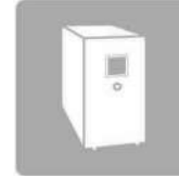
Diesel Generator Backup for Lifts & Common Area