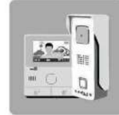
Colour Video Door phone system